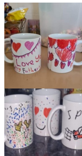
Creations for Father's Day

Next week, return to face-to-face learning at school.