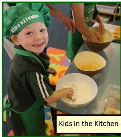
Kids in the Kitchen on Monday