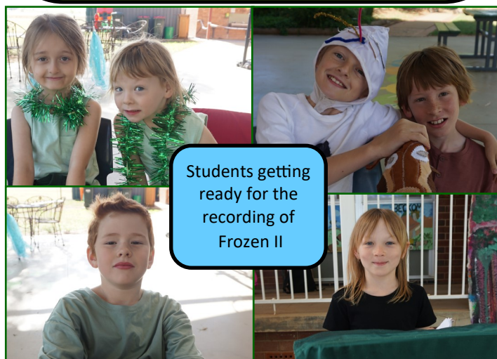
Students getting ready for the recording of Frozen II